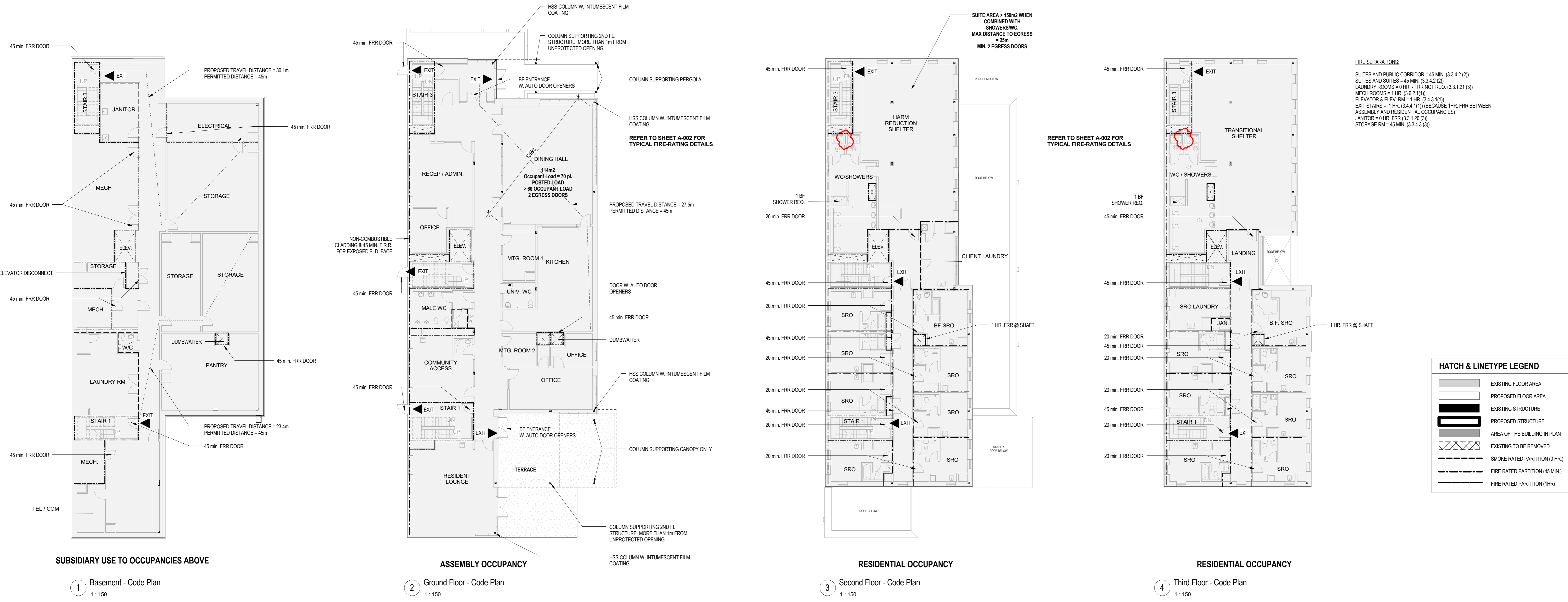
SUBSIDIARY USE TO OCCUPANCIES ABOVE ASSEMBLY OCCUPANCY RESIDENTIAL OCCUPANCY RESIDENTIAL OCCUPANCY